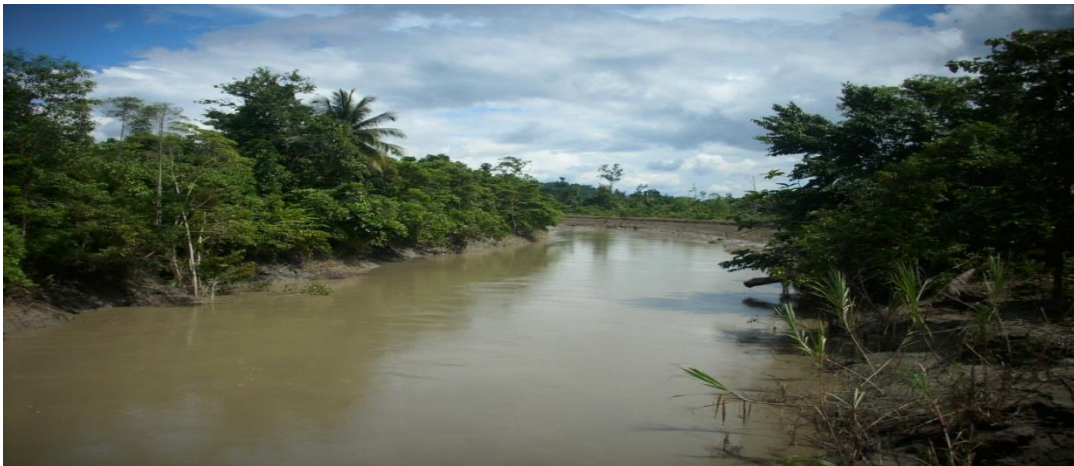
Figure 1. Photo : Tami Watershed, Papua as one of the Priority Watersheds in Indonesia