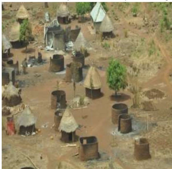
Fig 2: Tse Kumbur-Tongov ward vacated

The results clear the doubt that many people especially the crop farmers have fled from their homes and communities for their safety as a result of the security threat of the areas. The study gathered that many people from the affected communities are currently taking refuge in the IDP camps as can be seen in Figure 2 and 3. The displacement of crop farmers from their original homes, denial of access to their farms due to insecurity have social and economic implications on both the victims and the entire society because food production is vital to the livelihood of every one. Besides, the farming population of many communities in the study area has been depleted leading to wide spread hunger and poverty among the farmers.