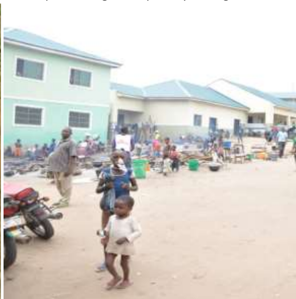
Fig 3: Refugees at IDP Camp, Abagena

The study also examined the death toll and injuries sustained by the population in the affected communities. The data presented in Table 2 shows the number of casualties recorded from different attacks by pastoralists in different communities within the study area obtained from secondary data sources from 2011-2018. The attacks on different communities of the study area as a result of the crop farmers-pastoralists has claimed 190 lives and injured many leading many people to widowhood and orphans. The number of death reported between June 2011- May 2018 was 190 persons while those injured were 52 persons (Ayua, 2018). Tyohemba (2014) reiterated that the loss of a household member through death may be a critical economic loss particularly, if that person was a major contributor to the household's livelihood. Availability and cost of labour is affected because many rural households depend on cheap family labour.