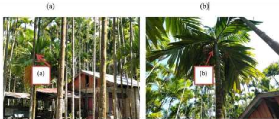
Figure 2. Areca catechu L. (a&b) in the yard of Skouw Mabo villagers, Jayapura City, Papua Province, Indonesia

in the market, this is evidenced by the price of a single areca nut ranging from Rp.50,000-500,000. The rise and fall of the price of areca nuts in the market is largely determined by the rainy season and summer. When it is summer, the small amount of areca nut produced causes the price to rise to Rp. 500,000. This is inversely proportional if in the rainy season, the production of areca nut will be excessive so that it can cause the price to only around Rp.50,000 in the market. Plant diversity in the yard is important to maintain income stability (Kujawka 2018). The income earned is also determined by the size of the family member (Dirimanova 2018). Utilization of village funds to develop other plant products to help the community when their income is not optimal. Other studies reveal that budget allocation policy is the second priority in agricultural policy in rural areas in Romania (Galluso 2017). Furthermore, in other studies also explained that the economic conditions of farm households can be developed with policies to provide reinforcement to them (Hendrarini 2018). Other research also states that farm households in the coastal areas of Papua are highly dependent on agricultural products sold to the market (Antoh et al. 2018).