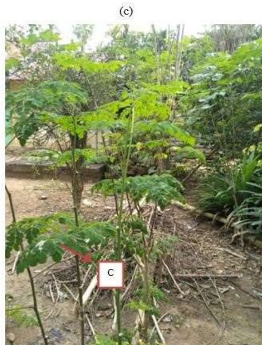
Figure 3. Moringa oleifera (c) found in the yard of the Buton community, in the village of Skouw Mabo, Jayapura City, Papua Province, Indonesia

Moringa is a type of introduction plant that goes to Skouw Mabo following the community's presence. Moringa is included in the type of large tree with a morphological form of woody plants and has many functions for the majority Butonese in RT3 (Fig c). Other studies suggest that the composition and structure of plants in the yard need to be considered in terms of their function and use (Ogwu 2014). Moringa plants can function as a vegetable but are also used as medicinal plants. Summed dominance ratio (SDR) value is calculated with a value of 10.8. This means that this plant is almost always found in community yards.