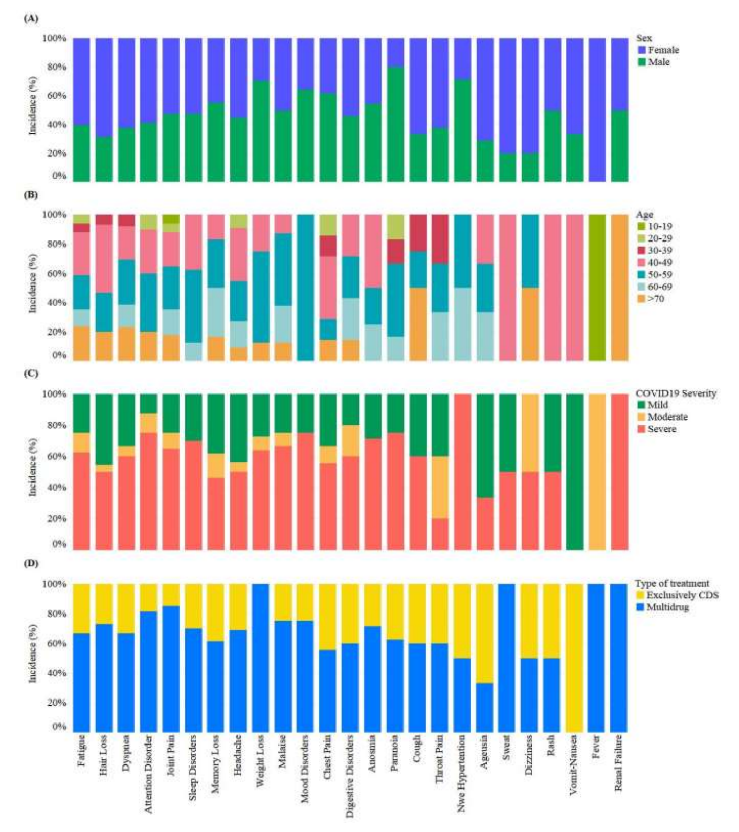
FIGURE 2. Incidence of the 25 different COVID19 long-term effects depending on (A) sex, (B) age, (C) COVID19 severity, and (D) Type of treatment.