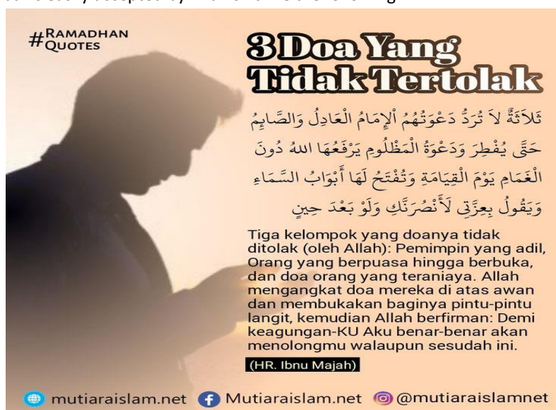
Figure 3. Example of a prayer hadith memes

Prayer hadith memes shared by informants related to prayers that are often used in daily life. For example, the meme of the hadith of the prayer of makbul is easily accepted by Allah swt like the following.