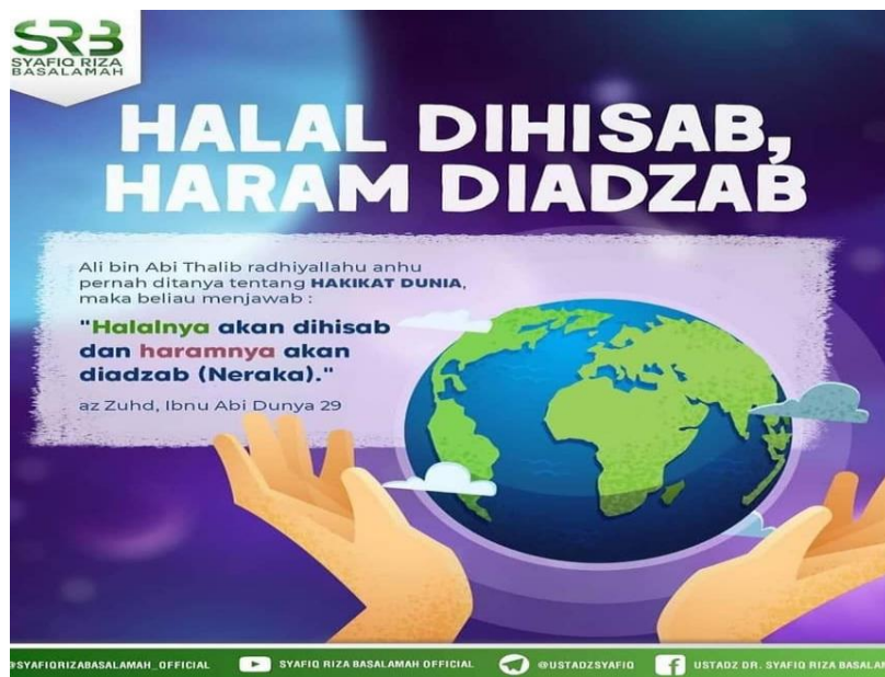
Figure 5. Example of a grave punishment hadith meme

The third category of hadith memes shared online is the end-of-time hadith memes in a hadith which tell about the end of the world, the end of life, heaven, and hell. These hadith memes are mainly meant to increase the awareness of Muslims about this end of life and to prepare themselves by doing good deeds. Examples of these hadith memes include those shown in Figure 7 below: