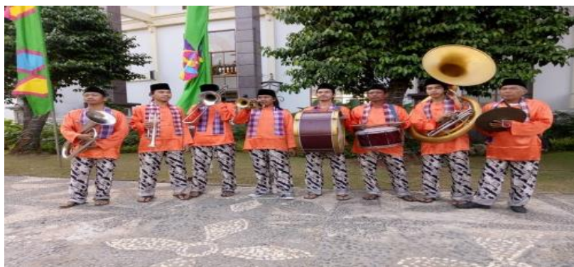
Gambar 2 Alat Musik Gambang Kromong