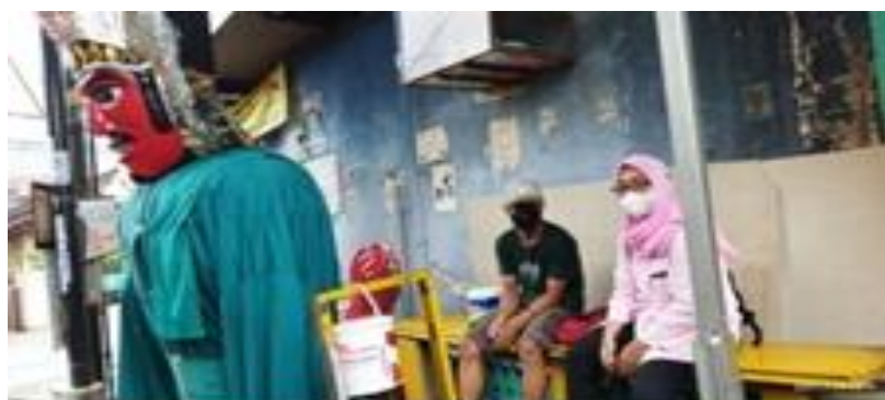
Gambar 4 Pengamen Ondel-Ondel Cilik