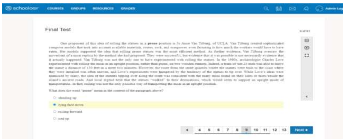
Figure 2. Various text appearance on student test LMS

In summary, the data reveals a strong positive perception of the role of the LMS-based reading test in fostering engagement and motivation in language learning, particularly in terms of diverse content and an engaging format. Respondents generally view this tool as a significant aid in maintaining their interest and motivating their learning efforts. The data suggests that students generally found the variety of reading materials and the format of the LMS-based reading test effective in keeping them engaged and motivated in their learning process. The following figure illustrate the text question appearance.