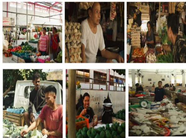
Figure 2: Observation and Q&A at Kosambi Market, Old Market, and Fish Auction Site

Interesting aspect of the community in Labuan Bajo lies in their social capital, which includes trust, norms, and networks. This social capital has already existed within the community but has not been optimally utilized. It should be leveraged by the people of Labuan Bajo in their daily lives to overcome hardships (Hanita, 2023). The presence of mutual trust, kinship, and a sense of community acts as a support system for the community, especially during challenging times (Putnam and Robert, 2000). The social capital among the people of Labuan Bajo, combined with their natural environment and cultural context, motivates them to take action to meet their daily needs and innovate, creating breakthroughs in the form of valuable services and products.