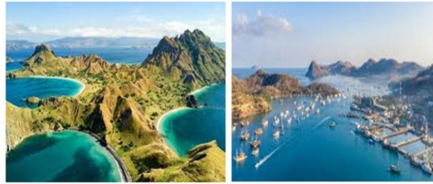
Figure 1: Scenic View of the Islands in Labuan Bajo

In fact, household consumption and expenditures, as well as living conditions, are indicators of family welfare.