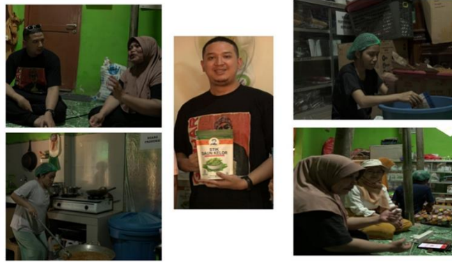
Figure 6: In-Depth Interview at the Production Site of a Local Culinary UMKM