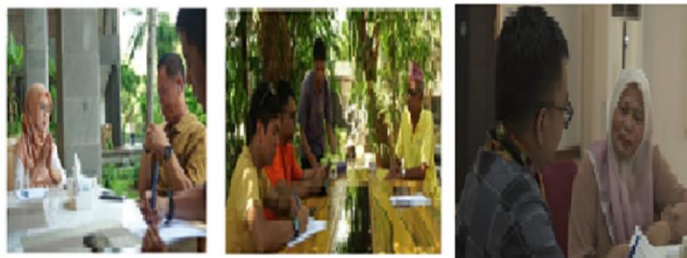
Figure 5: Phenomenological Stages with In-Depth Interviews of Informants